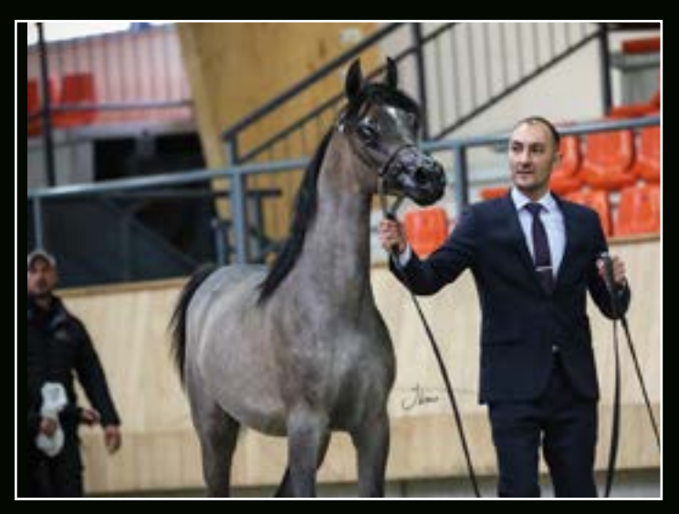
Bacchus KA (QR Marc x ASE Bisiriya Hlayyil) bred and owned by Knocke Arabians