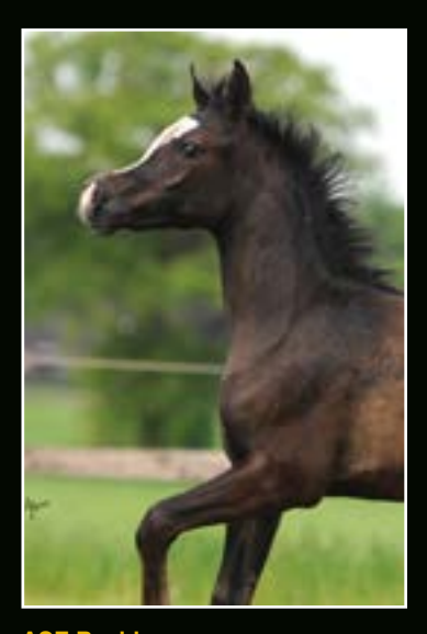
ASE Bashira (Amir Ashiraf x ASE Bisriiya Hlayyil