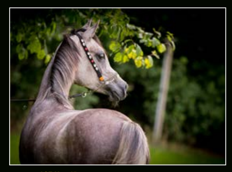
ASE Magnificent (ZT Magnanimus x ASE Bisiriya Hlayyil)