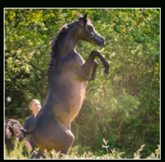
ASE Farhan (RFI Farid x ASE Bisiriya Hlayyil)