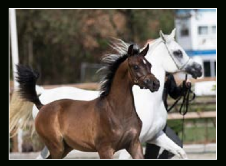
ASE Farhan (RFI Farid x ASE Bisiriya Hlayyil)